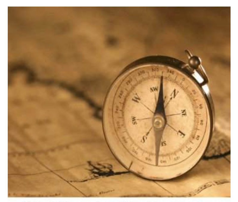
THE WORLD AND THE INDIVIDUAL: GIFFORD LECTURES DELIVERED BEFORE THE UNIVERSITY OF ABERDEEN

By Josiah Royce DOC | *audiobook | ebooks | Download PDF | ePub